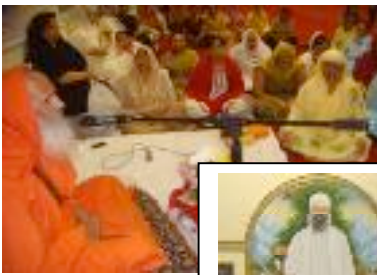
Geeta Bhawan ↑ Hindu Temple in Derby