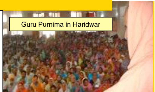
Guru Purnima in Haridwar