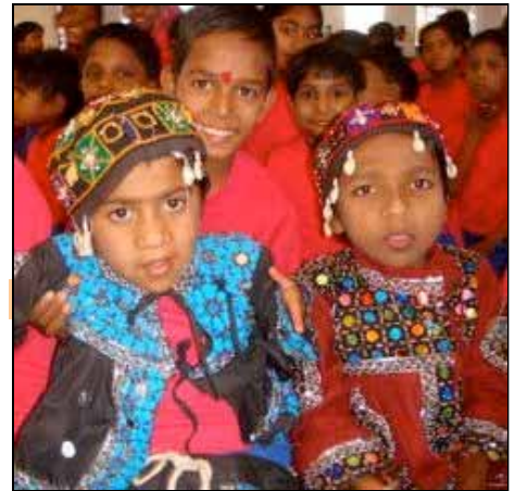
Children in the Paramanand Center for Developing Intellect gave a terrific