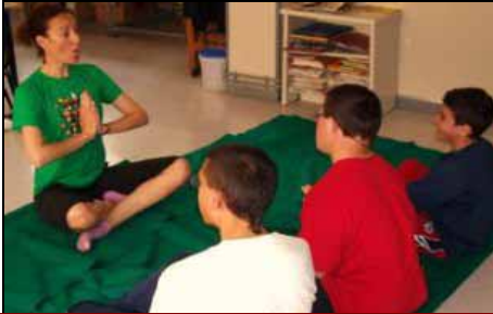
Children learn yoga and pranayam